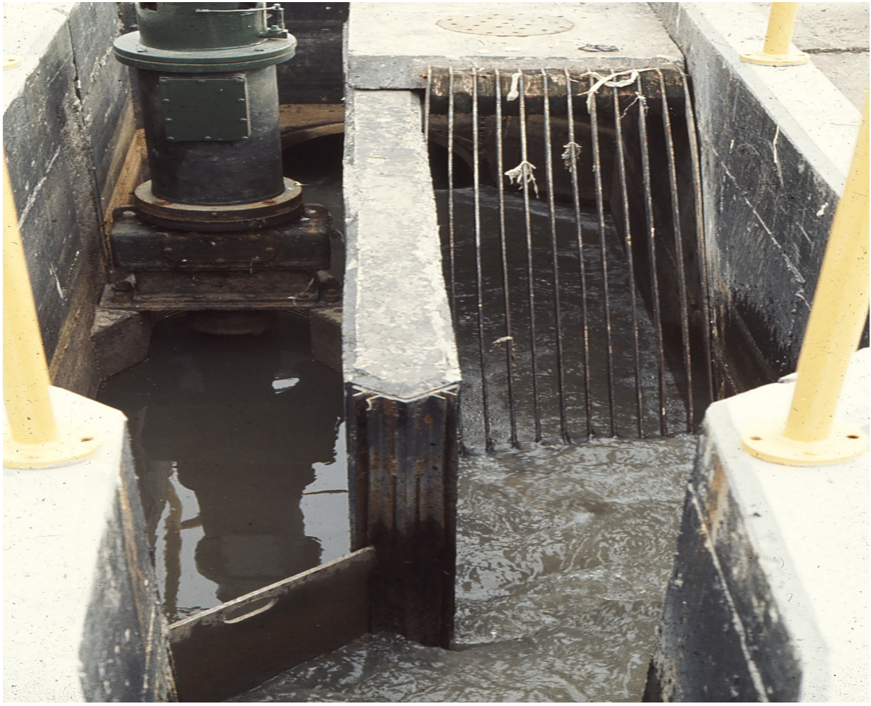
Bar rack (on right) in service. Comminuter (on left) out of service.