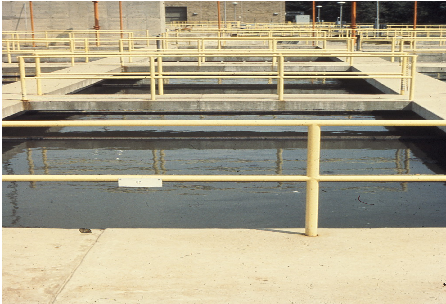
Primary settling tank